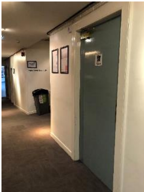
Disabled toilet in Corridor