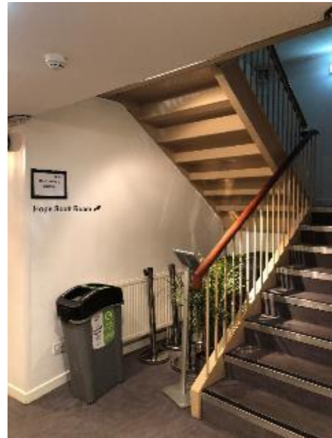
Stairs from Corridor