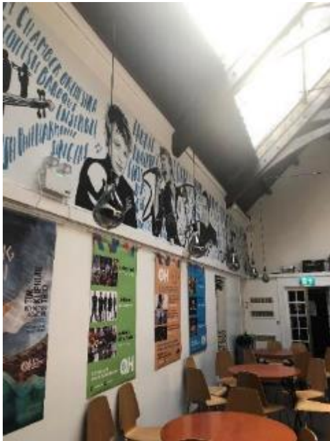
Higher ceiling and silver bulbs