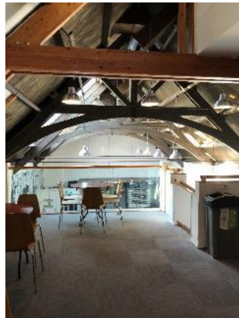
Hope Scott Room

Staff are available to help during your visit. If you have any questions you can ring us on Telephone: +44 (0)131 668 3456 Or email us directly at our Email: info@queenshalledinburgh.org