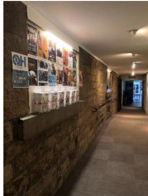
Stone wall along Corridor