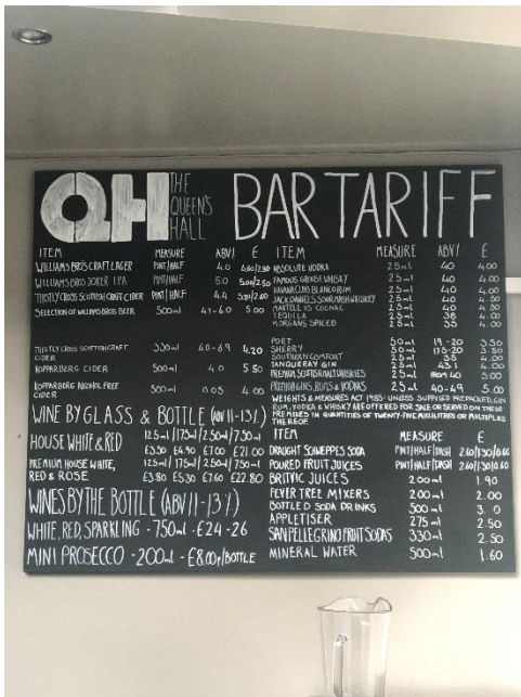
Blackboard showing bar prices and drinks available