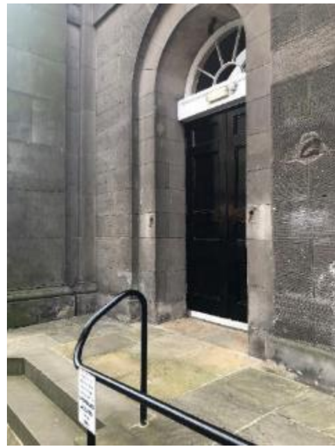
Entrance most frequently used – to right of main entrance