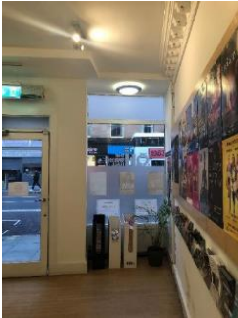
Box Office looking out towards Clerk Street