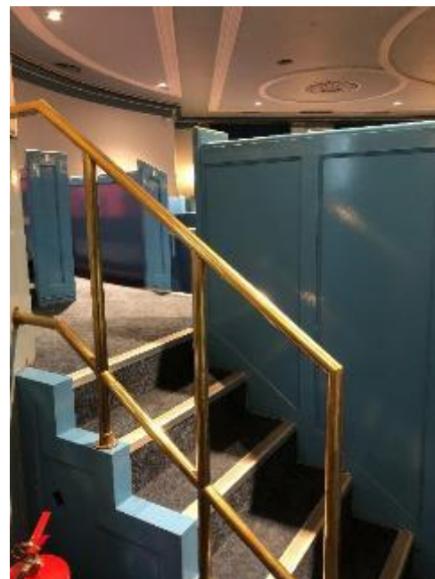
Steps up to the Centre Gallery

Staff are available to help during your visit. If you have any questions you can ring us on Telephone: +44 (0)131 668 3456 Or email us directly at our Email: info@queenshalledinburgh.org