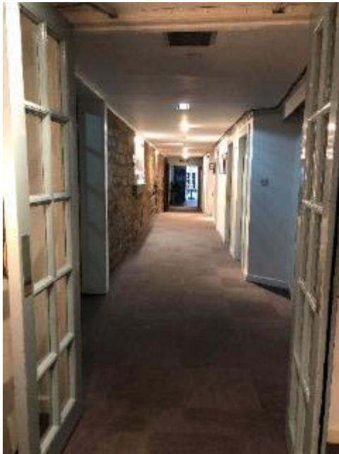
Looking down to the Bar