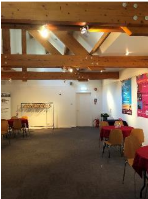
Hope Scott Room