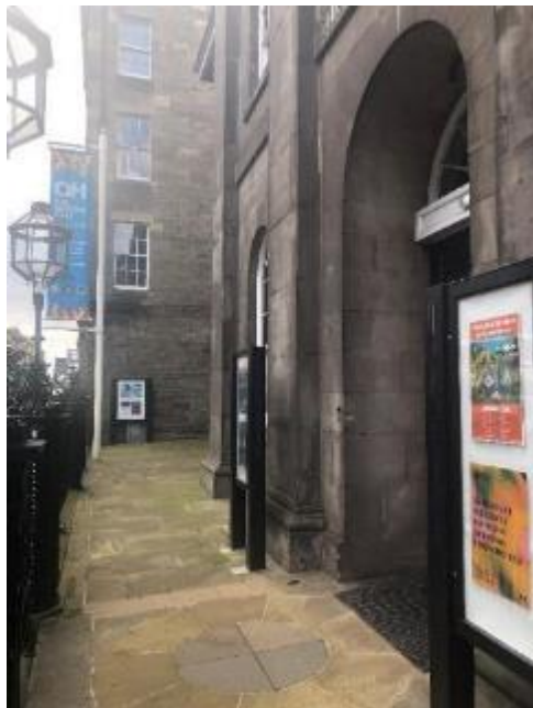
General outside view