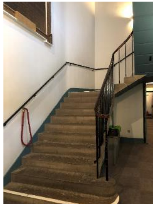
Stairs to the Gallery

Staff are available to help during your visit. If you have any questions you can ring us on Telephone: +44 (0)131 668 3456 Or email us directly at our Email: info@queenshalledinburgh.org