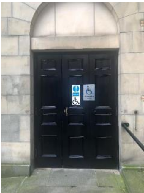
Power-assisted step-free access