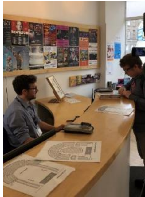
Buying a ticket