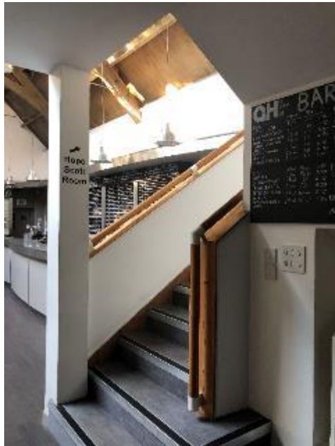
Stairs from Bar