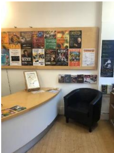
Chair at lowered counter