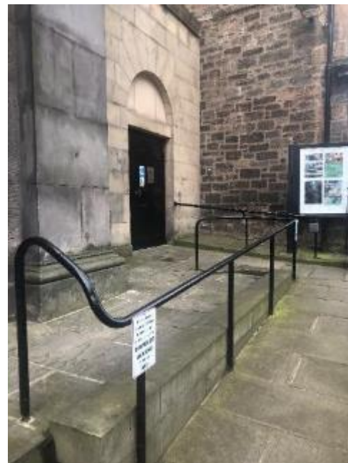
Ramp to power-assisted door

Staff are available to help during your visit. If you have any questions you can ring us on Telephone: +44 (0)131 668 3456 Or email us directly at our Email: info@queenshalledinburgh.org