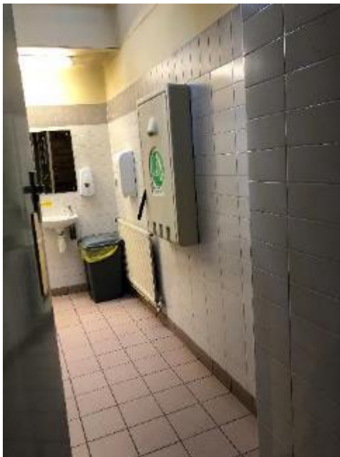
Accessible toilet entrance