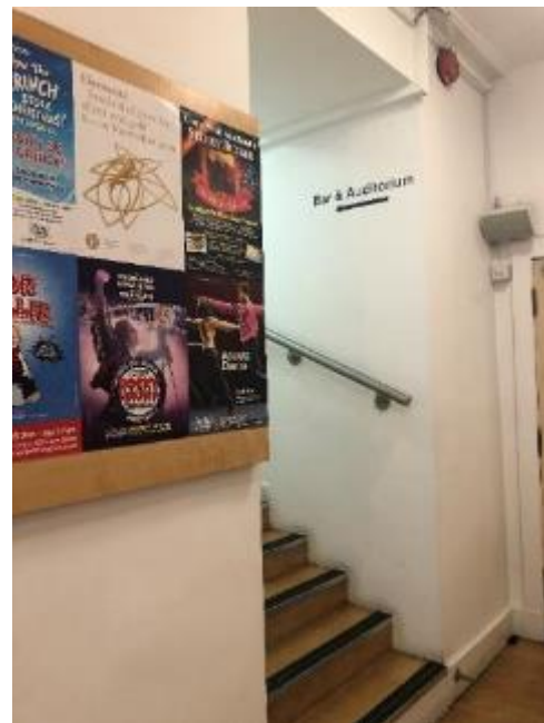
Stairs to Bar and Auditorium

Staff are available to help during your visit. If you have any questions you can ring us on Telephone: +44 (0)131 668 3456 Or email us directly at our Email: info@queenshalledinburgh.org