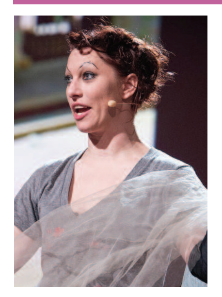
Presented by DF Concerts